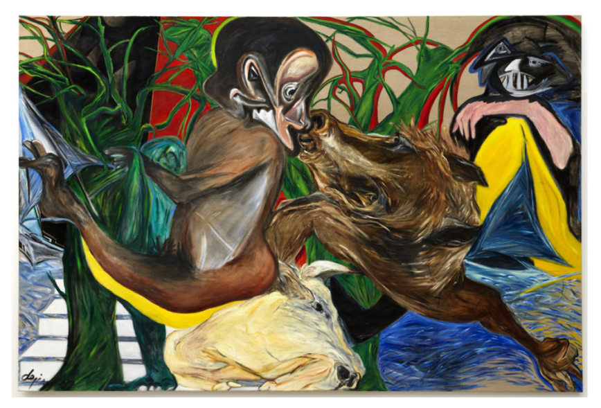
Jacqueline de Jong, Ceux qui vont en bateau , 1987.