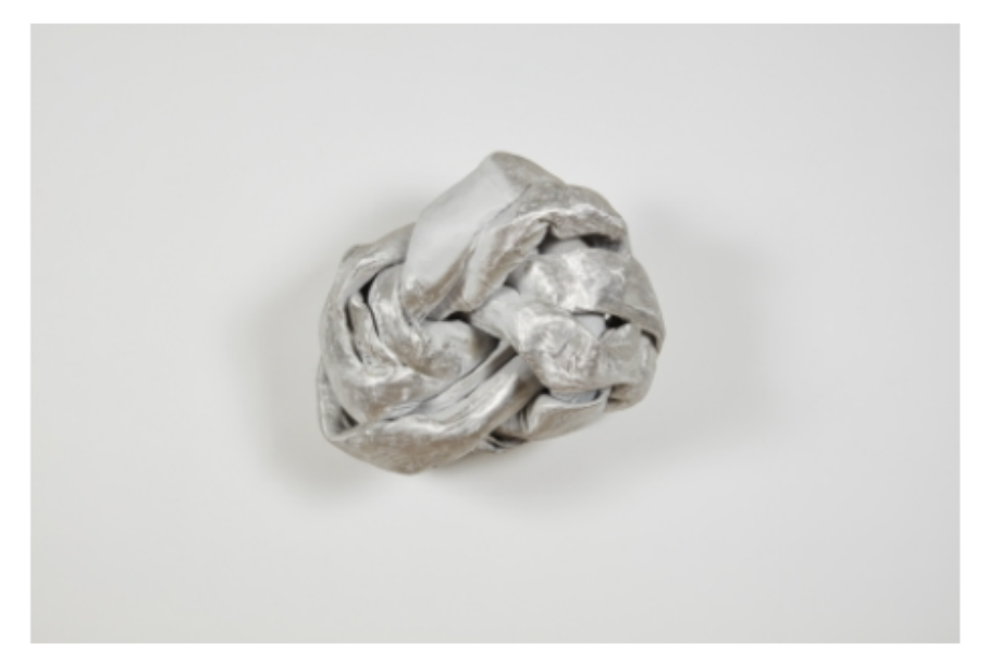
Lynda Benglis, Kilo (1973-4)

At Cheim & Read, the body of works draw a distinct line towards sexually suggestive movement and the liquid processes that render them. Made as the artist moved into the 1970's, the pieces are lushly colored, sculptural build-ups of pigmented wax, which transform their wood and masonite supports into ambisexual totems, the accumulated gestures and pressings of material onto its surface moving between a sensual reverie with her work, and an alien facade that brings to mind a coral-like encrustations. By contrast, her latex pours lampoon the machismo of her Ab-Ex contemporaries, lumpen objects charged with a sense of humor and critique.