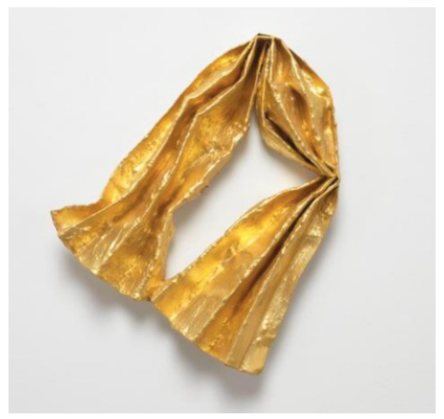
Lynda Benglis, Current (1979), via Cheim & Read